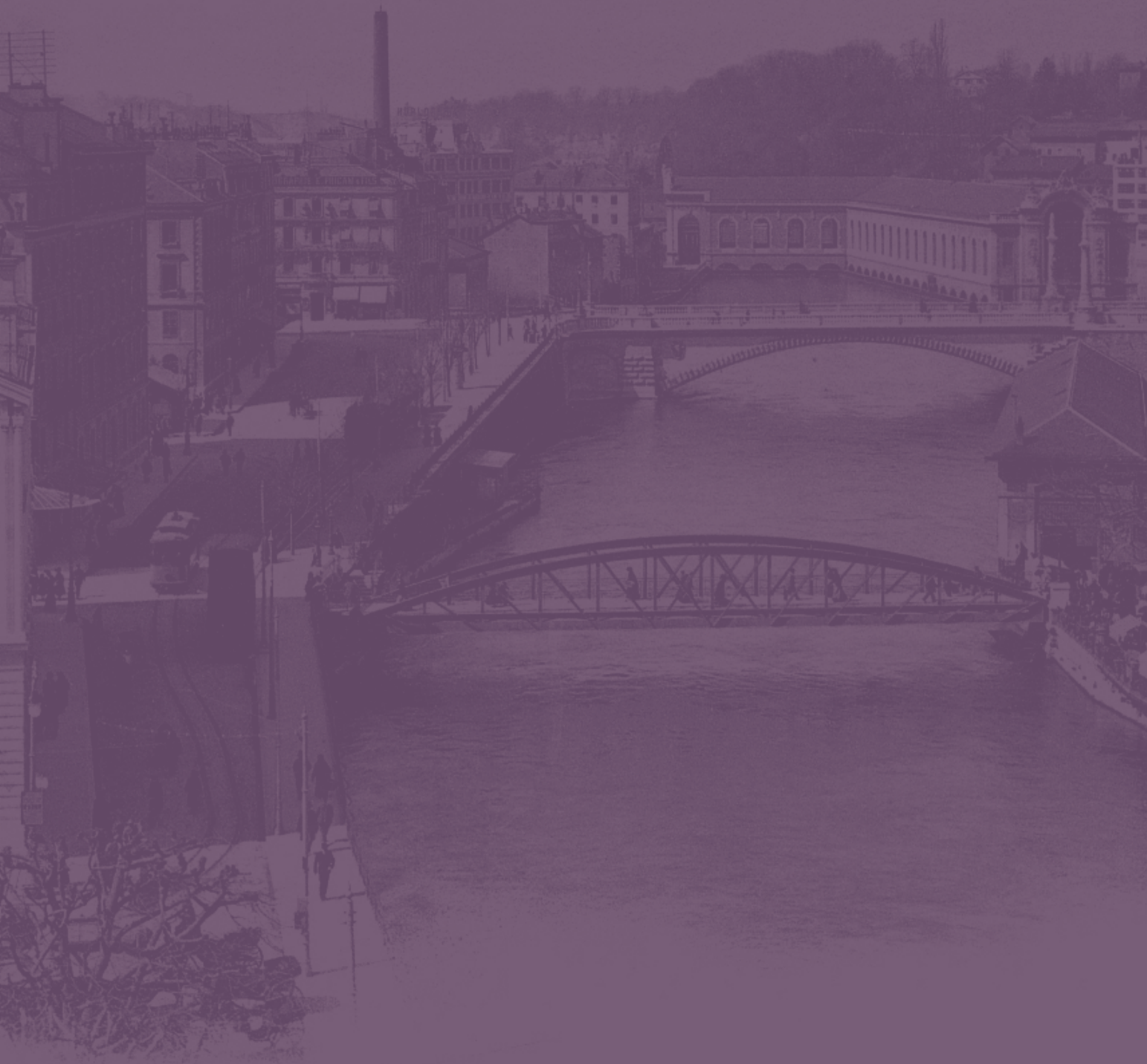
Genève — Le Rhône et le Quai de la Poste