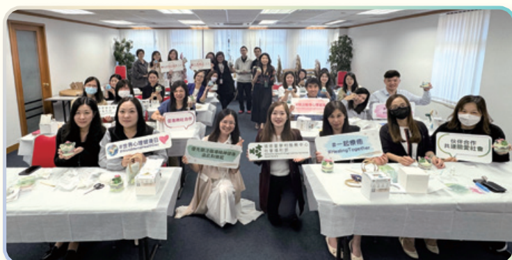
Facilitated by the workshop mentor from Epworth Village Methodist Church, staff creating their handmade aroma candles in a mental health awareness workshop.