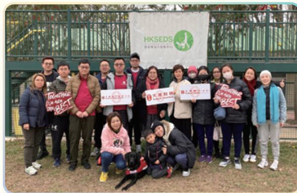
Staff and their family members visiting the Hong Kong Seeing Eye Dog Training School to understand the needs of people with visual impairments and how guide dogs assist them in their daily lives.