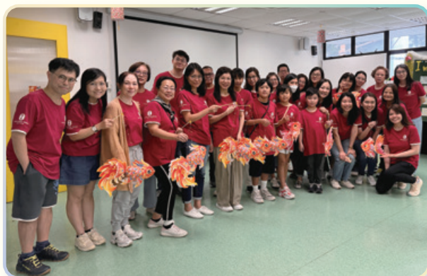
Collaborating with St. Barnabas Society and Home to organise a Mid-Autumn Festival activity "Lantern Making and Care Packages Distribution", staff volunteers and their family members show care to the elderly they served.