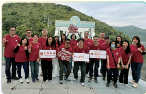
Staff participating in coral exploration tour at Hoi Ha Wan organised by the World Wildlife Fund-Hong Kong to understand the importance of marine life protection.