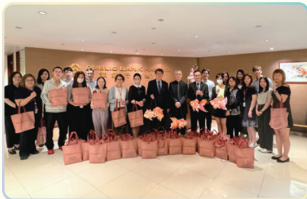
Staff volunteers packed 100 care packages for delivery to the elderly for celebration of Mid-Autumn Festival.